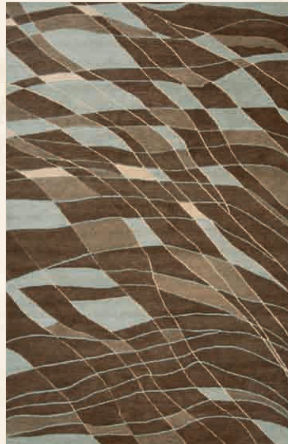
AP09 Brown 5'6" x 8'