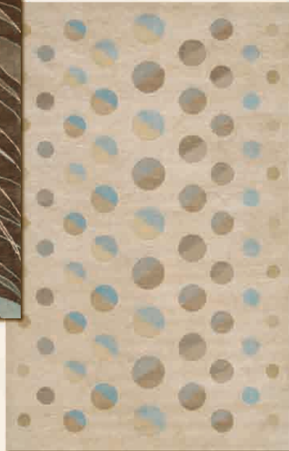
AP07 Beige 5'6" x 8'