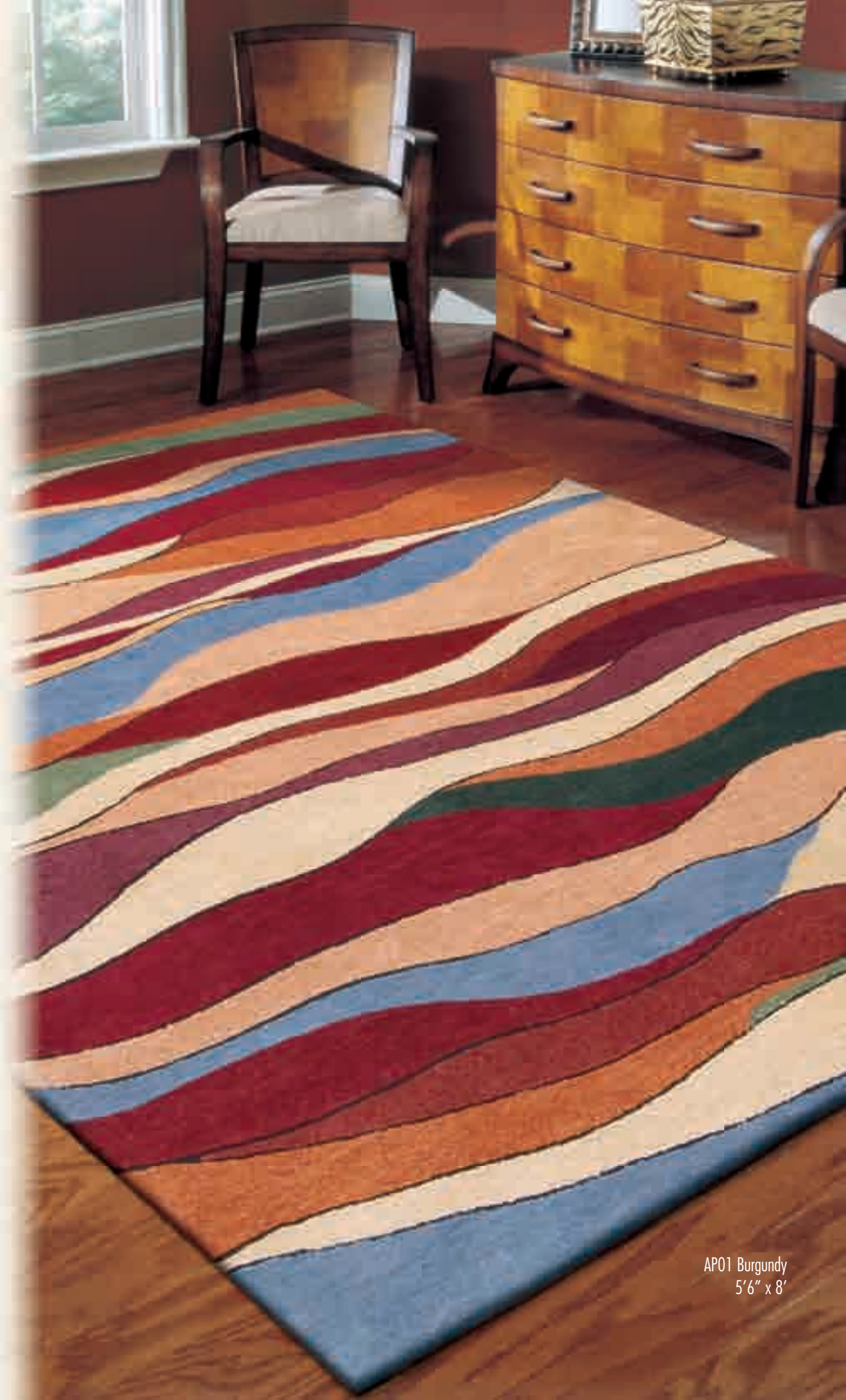
AP01 Burgundy 5'6" x 8'