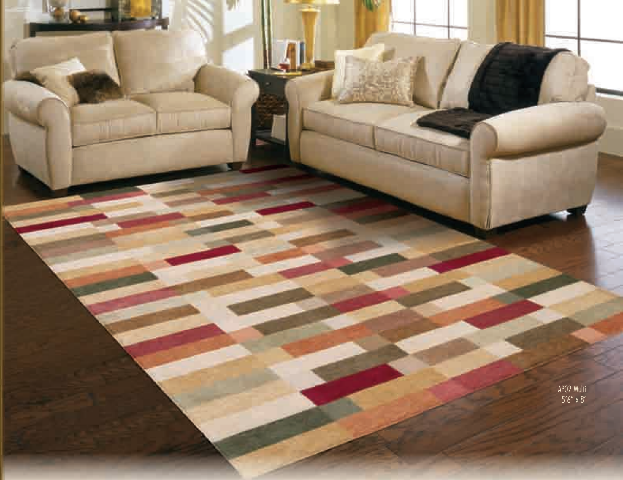
AP02 Multi 5'6" x 8'